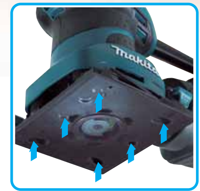
High Dust Extraction Dust is extracted through 6-hole under Pad and collected into Dust Bag. Also, instead of Dust Bag, Makita Vacuum Cleaner can be connected to the tool using Adapter.